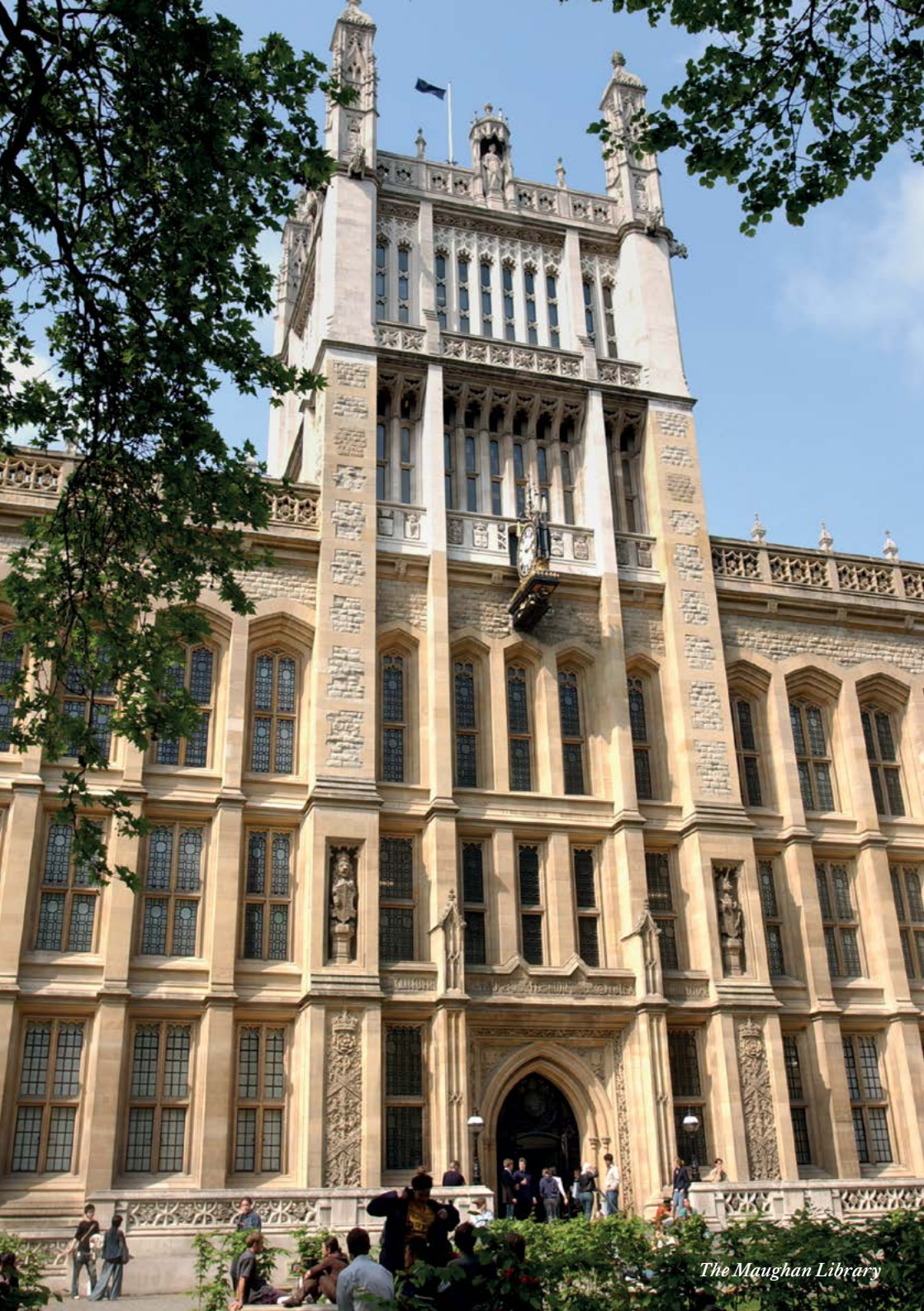
The Maughan Library