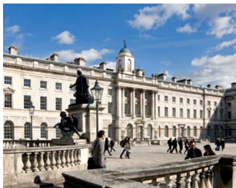
East Wing of Somerset House